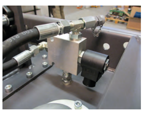
El. LS control for the pump. For crane LS-control an additional