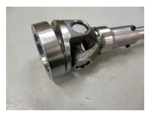
Drive shaft coupled to the crank shaft via cardan joint. Flexible jaw coupling on the pump. change over valve is installed.