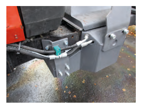
Simple installation mounted on the front support of the tractor.