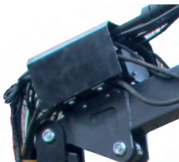
All functions are el-proportional which gives accuracy feeling.