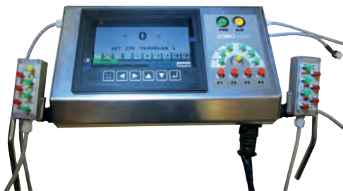
Easily movable controls. JOBO CAN MID or CCD