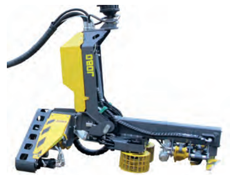
Harvester head is standard and it can easily be mounted on other type of base machine.